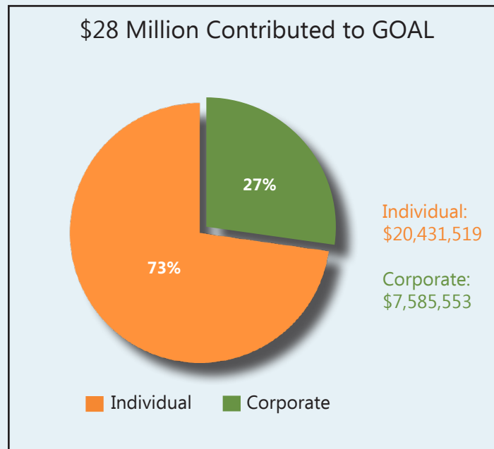
Corporate and Individual Contributions to GOAL Since Inception